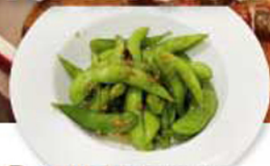
④④ Sauted Edamame ¥480 (税込 ¥528)