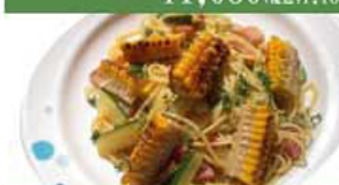
⑩ Peperoncino of bacon, summer vegetable ¥1,080 (税込 ¥1,188)