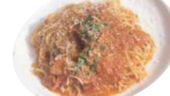
6 Tomato sauce spaghetti of bacon, onion, red pepper