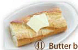
④① Butter baguette ¥350 (税込 ¥385)