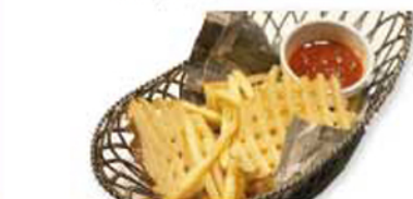
⑤⑤ French fries ¥580 (税込 ¥638)