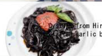
⑤ Spaghetti of squid ink ¥1,080 (税込 ¥1,188)