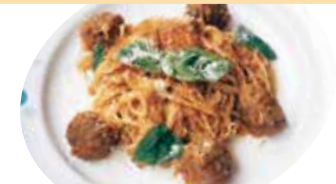
12 Tomato sauce linguine of meatballs, basil, mozzarella