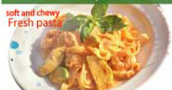
⑨ Tomato cream sauce tagliatelle of shrimp, avocado ¥1,080 (税込 ¥1,188)