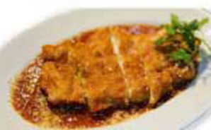
⑤③ Chicken cutlet with tomato sauce ¥780 (税込 ¥858)