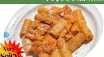
⑪ tomato carbonara rigatoni (extremely thick macaroni) ¥1,180 (税込 ¥1,298)