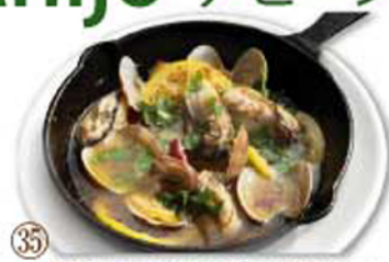
③⑤ Ahijo: oyster, clam, lemon ¥1,380 (税込 ¥1,518)