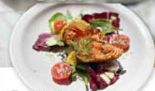
④③ Sicilian style salmon cutlet ¥1,180 (税込 ¥1,280)