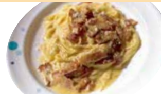
11 Bacon carbonara tagliatelle