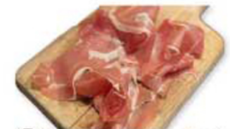
④⑧ Prosciutto from Spain ¥780 (税込 ¥858)