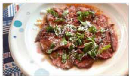
③⑧ Homemade Roast beef ¥1,280 (税込 ¥1,408)