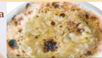
17 Honey and gorgonzola cream sauce