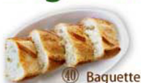
④⑩ Baguette ¥300 (税込 ¥330)