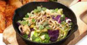
④⑤ Sauted cabbage, baby sardine, perilla ¥580 (税込 ¥638)