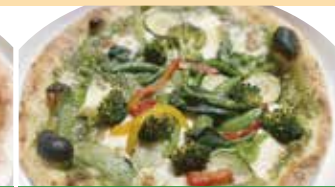
18 Summer vegetables mozzarella basil sauce