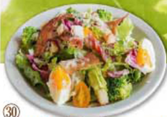
③⑩ Caesar's salad with egg, prosciutto ¥900 (税込 ¥990)