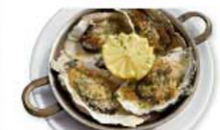
④⑨ Oven grilled oyster from Hiroshima 2個 ¥980 (税込 ¥1,078) 4個 ¥1,960 (税込 ¥2,156)