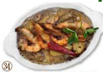
③④ Ahijo: Soft shell shrimp ¥1,180 (税込 ¥1,298)