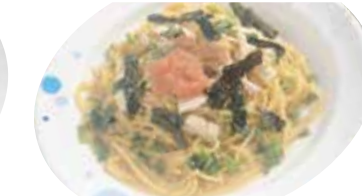
10 Garlic spaghetti of chicken plum, perilla, cod roe