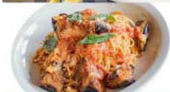
④ Tomato sauce spaghetti of eggplant, mozzarella, cheese ¥1,080 (税込 ¥1,188)