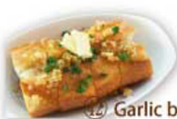
④② Garlic baguette ¥380 (税込 ¥418)