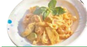
14 Tomato cream tagliatelle of shrimp, avocado