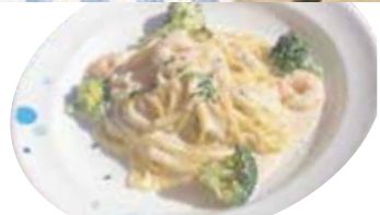
2 Cod roe cream sauce spaghetti of shrimp, broccoli