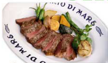
③⑦ Beef sirloin garlic steak ¥2,180 (税込 ¥2,398)