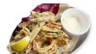
⑤① Fried squid and mall sardines from Hiroshima ¥980 (税込 ¥1,078)