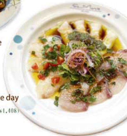
⑤④ Assortment of 3 carpaccio of the day ¥1,280 (税込 ¥1,408)