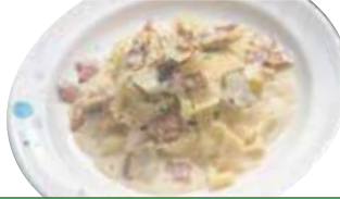
13 Cream sauce pappardelle of raw ham, mushroom