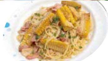
3 bacon, roasted corn, peperoncino