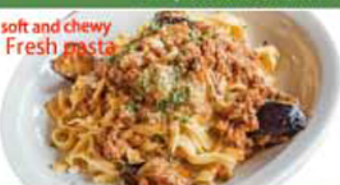
⑧ Meat sauce tagliatelle of eggplant, mozzarella ¥1,080 (税込 ¥1,188)