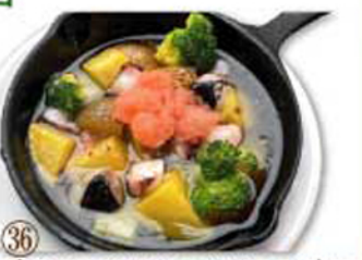
③⑥ Ahijo: octopus, potato, cod roe ¥1,180 (税込 ¥1,298)