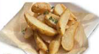
④⑥ French fries of truffle ¥480 (税込 ¥500)