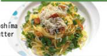
⑥ Peperoncino of whitebait, green perilla, yuzu pepper ¥1,080 (税込 ¥1,188)