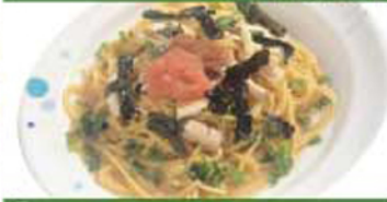
③ Garlic spaghetti of chicken plum, perilla, cod roe ¥980 (税込 ¥1,078)