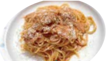
8 Very spicy!! Bacon tomato carbonara