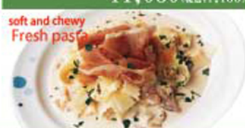
⑫ Cream sauce pappardelle of raw ham, mushroom ¥1,380 (税込 ¥1,518)