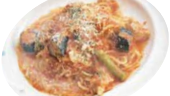
5 Tomato sauce spaghetti of eggplant, mozzarella, cheese