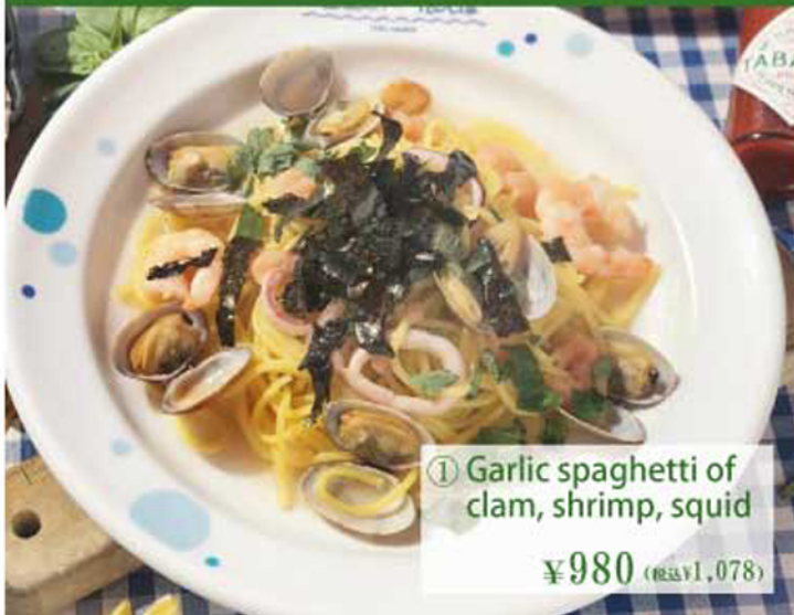
① Garlic spaghetti of clam, shrimp, squid ¥980 (税込 ¥1,078)