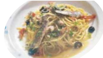
9 Garlic spaghetti of tomato oiled sardines, perilla