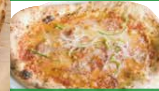
19 Salami, mozzarella onion, tomato sauce