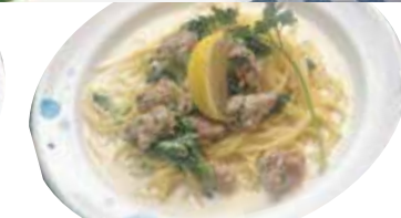
4 Lemon cream spaghetti of salsiccia (raw sausage), spinach