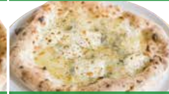
20 4 kinds of cheese