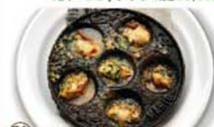
⑤② Oysters from Hiroshima Grilled garlic butter ¥1,280 (税込 ¥1,408)