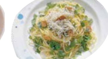
7 Peperoncino with whitebait, green perilla, and yuzu pepper