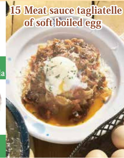
15 Meat sauce tagliatelle of soft boiled egg