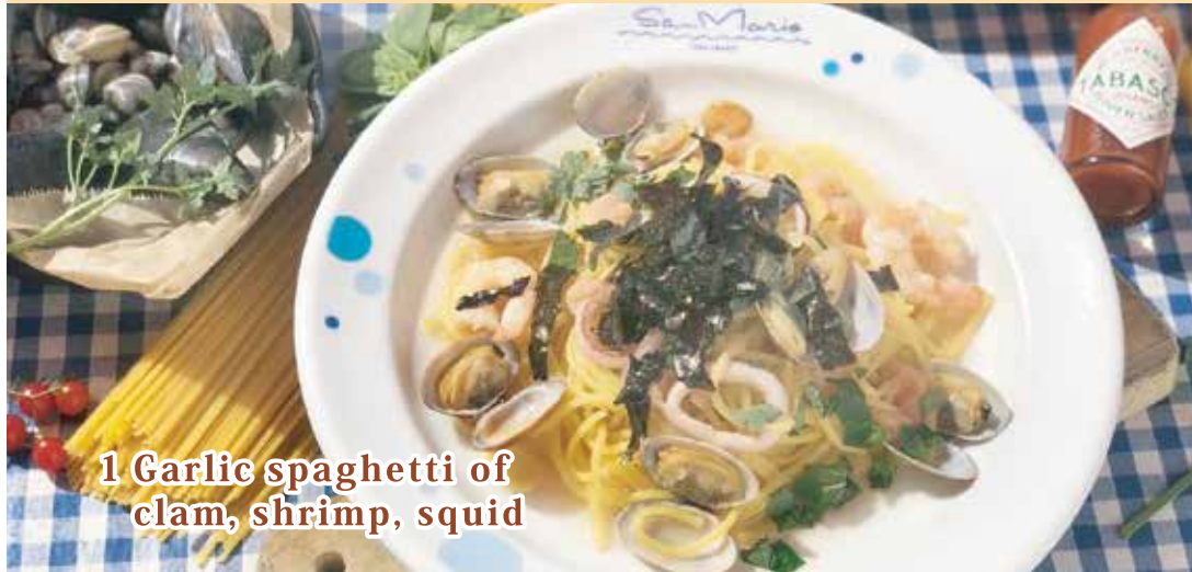
1 Garlic spaghetti of clam, shrimp, squid