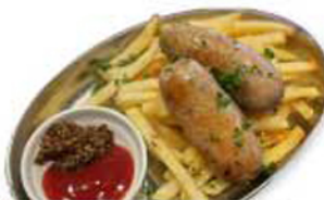
④⑦ Homemade sausage & potatoes ¥880 (税込 ¥968)