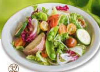
③② Vegetable healthy salad ¥800 (税込 ¥880)