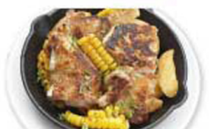
⑤⑩ Roasted chicken and corn lemon butter sauce ¥1,180 (税込 ¥1,298)