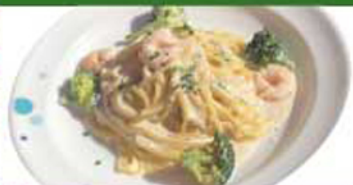
② Cod roe cream sauce spaghetti of shrimp, broccoli ¥980 (税込 ¥1,078)