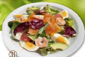
③① Salmon, Shrimp, avocado ¥1,080 (税込 ¥1,188)